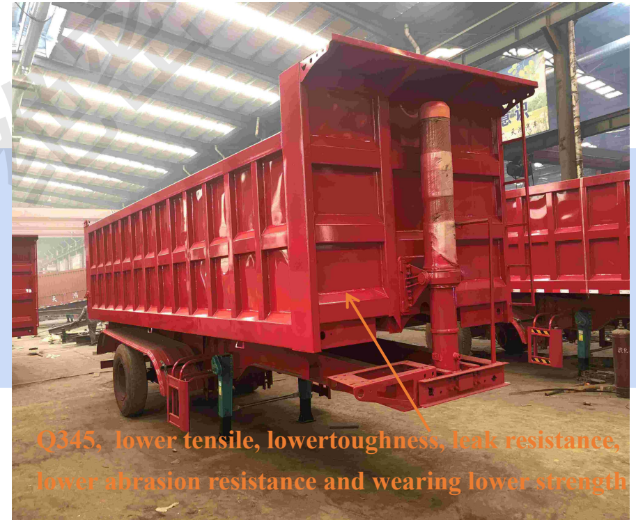
Marketing dumper trailer steel Q345

ZF Dumper semi trailer adopts heavy duty machine' s materials Q550, which is very famous for its high tensile, strong toughness, fatigue resistance, abrasion resistance and wearing strength. It is the more suitable materials for heavier transportation trailers and not easily deformed.