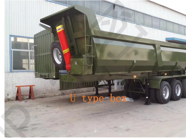
U type box