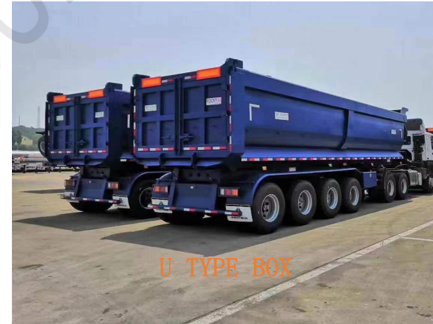
U TYPE BOX