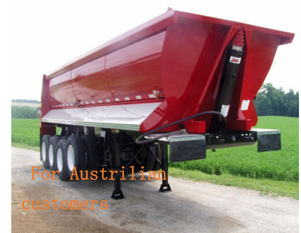
For Austrilian customers