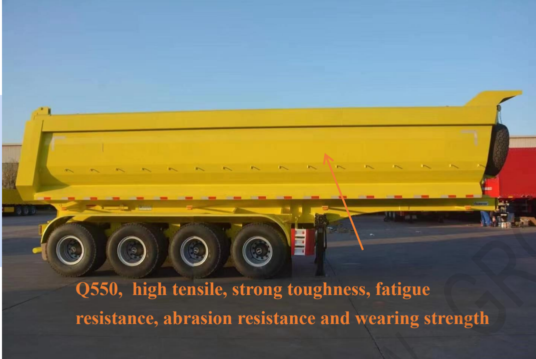
ZF truck trailer dumper trailer steel Q550