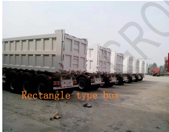
Rectangle type box