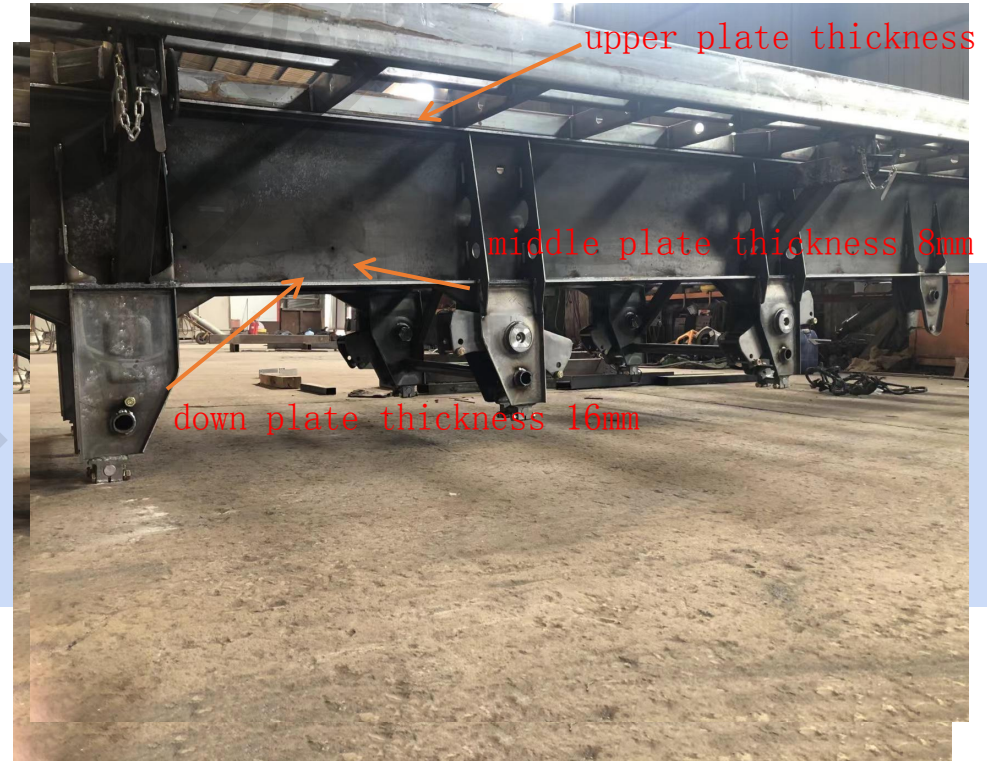
Marketing dumper trailer main beam

Q 345 steel, the height of the beam is 500mm. upper plate is 14 mm, down plate is 16 mm, middle plate is 8 mm., low strength, low lifting force, bad rigidity, bad toughness, low bearing capacity, and will permanent deform easily. And many suppliers adjust the main beam's thickness according to the customer's price.