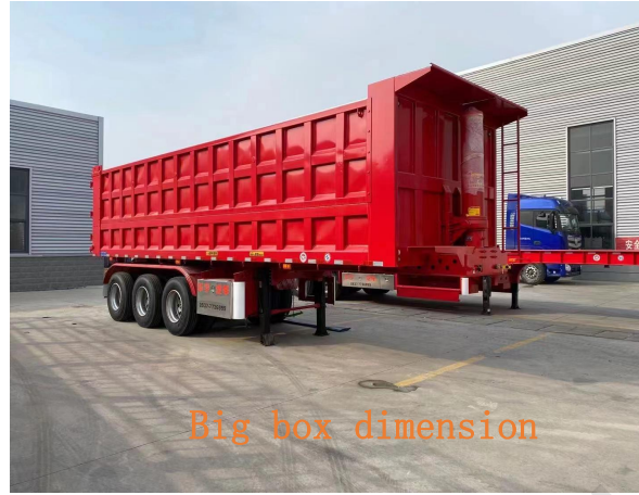
Big box dimension